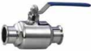
Hygienic Straight Ball Valve