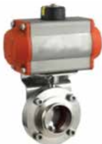
Pneumatic Butterfly Valve