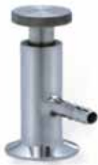
Hygienic Sampling Valve

Working Pressure : Max 10 Bar Nominal Diameter : 1" - 4" Connection : Tri-Clamp