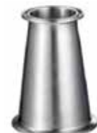
Reducer Concentric Ferrule