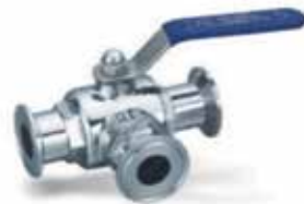
Hygienic 3 Way Ball Valve