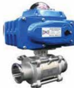
Hygienic 3PC Motorize Ball Valve

Mounting Pad : ISO 5211 Air Supply : Max 8 Bar Air Connection : NAMUR Standard Actuator Body : Alumunium Alloy with epoxy Polyester Paint Working Type : Single Act / Double Act *Accessories : + Limit Switch + Positioner Spring with High Torque Performance High Torque Performance ( Max 5000 Nm )