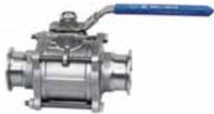
Hygienic 3PC Ball Valve