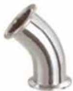
Elbow 45 Deg Ferrule