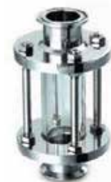
Hygienic Inline Sight Glass