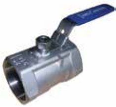
1-PC Ball Valve