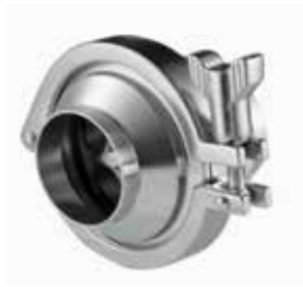
Weld Hygienic Check Valve