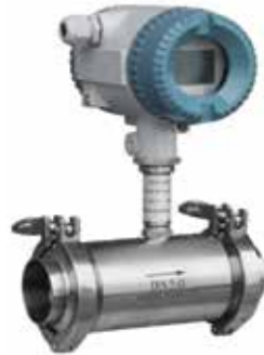
Hygienic Turbine Flowmeter