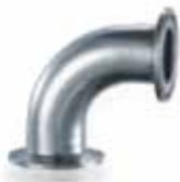
Elbow 90 Deg Ferrule