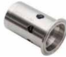
Vacuum Relief Valve

Working Pressure : Max 10 bar Nominal Diameter : 1" - 4" Connection : Weld, Tri-Clamp, Union