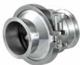
Tri - Clamp Hygienic Check Valve