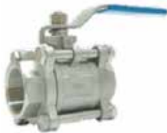
3-PC Ball Valve