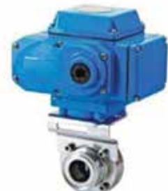
Motorize Butterfly Valve