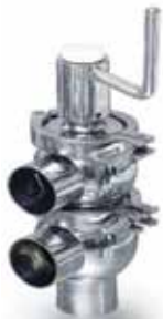
Hygienic Manual Reversing Valve