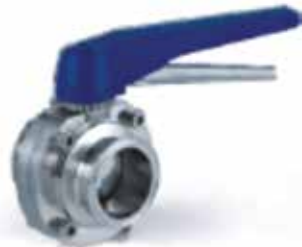
Tri-Clamp Butterfly Multi Position