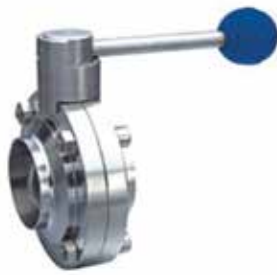
Weld Butterfly Pulling Lever