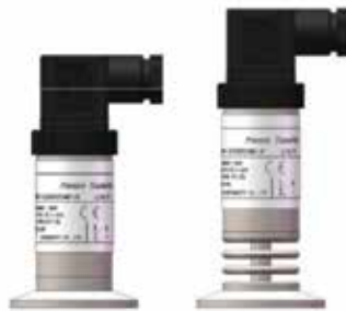
Tri-Clamp Pressure Transmitter