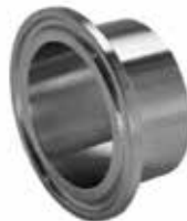
Sanitary Ferrule Clamp