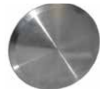
Sanitary Blind Ferrule