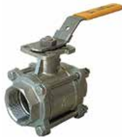
3-PC Ball Valve Mounting Pad