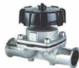
Hygienic Diaphragm Valve

Body Material : AISI 316 / AISI 316L Membrane Material : VMQ / EPDM + PTFE Working Temperature : VMQ ( -50 - 180 DegC ) EPDM + PTFE ( -25 - 250°C ) Connection Type : Weld Connection Tri-Clamp Connection Size : 1/2" - 2.5" / DN15 - DN65 Working Pressure : Max 10 Bar Operating : Manual Operated Air Actuated Inside Treatment : Ra ≥ 0.4 – 0.8 u m Outside Treatment : Ra ≥ 0.8 – 1.6 u m