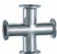
Sanitary Cross Ferrule