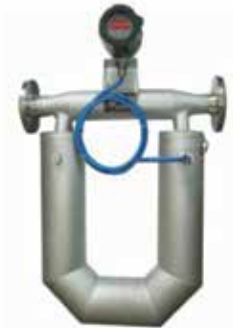
Hygienic Coriolis Flowmeter