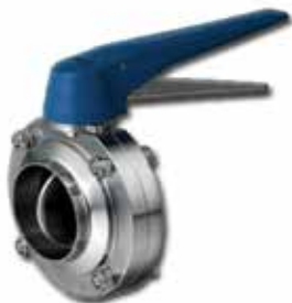
Weld Butterfly Multi Position