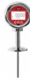
Tri - Clamp Temperature Gauge