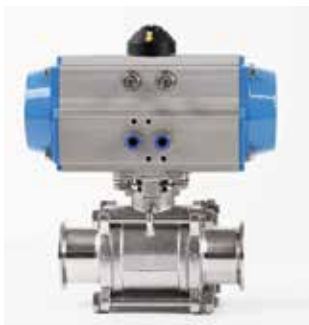
Hygienic 3PC Pneumatic Ball Valve