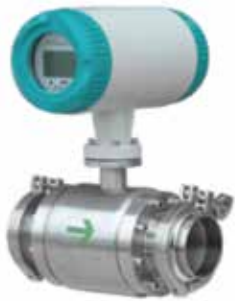
Hygienic Electromagnetic Flowmeter