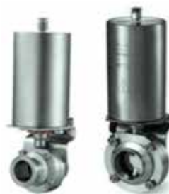
Pneumatic Cylinder Butterfly