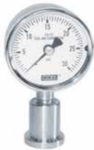
Sanitary Pressure Gauge