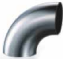
Elbow 90 Deg