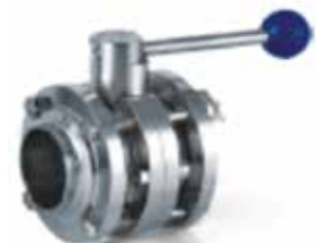
3PC Weld Butterfly Valve