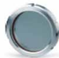
Union Sight Glass