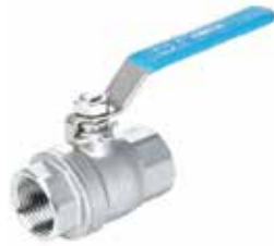
2-PC Ball Valve