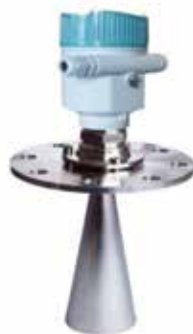
Radar Level Transmitter