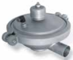
Adjust Constant Pressure Relief Valve

To automatically allow air to enter into the piping system to prevent vacuum conditions that could siphon the water from the system and damage water heater/tank equipment.