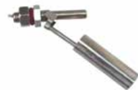
Mini Float Level Switch