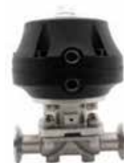
Hygienic Pneumatic Diaphragm Valve