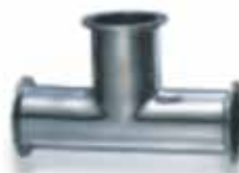
Equal Tee Ferrule