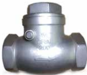
Swing Check Valve