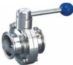
Tri-Clamp Butterfly Pulling Lever